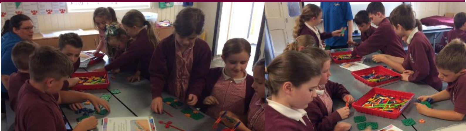
Dosbarth 3 and 4 applied lots of STEM skills in their Xplore Workshop this week.

95% Whole School Attendance (Wrexham 94%)