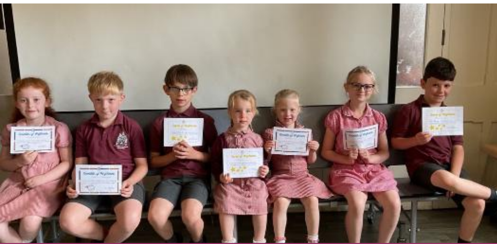
Our Stars of the week!

Our email system has changed to BromCom Please check you spam/junk files for St Chad's Church in Wales School- 15301@bromcomcloud.com and add it to your contacts To respond to an email please use our mailbox email above.