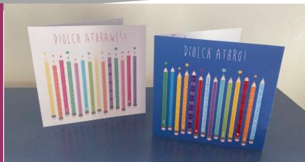
Our Stars of the week!