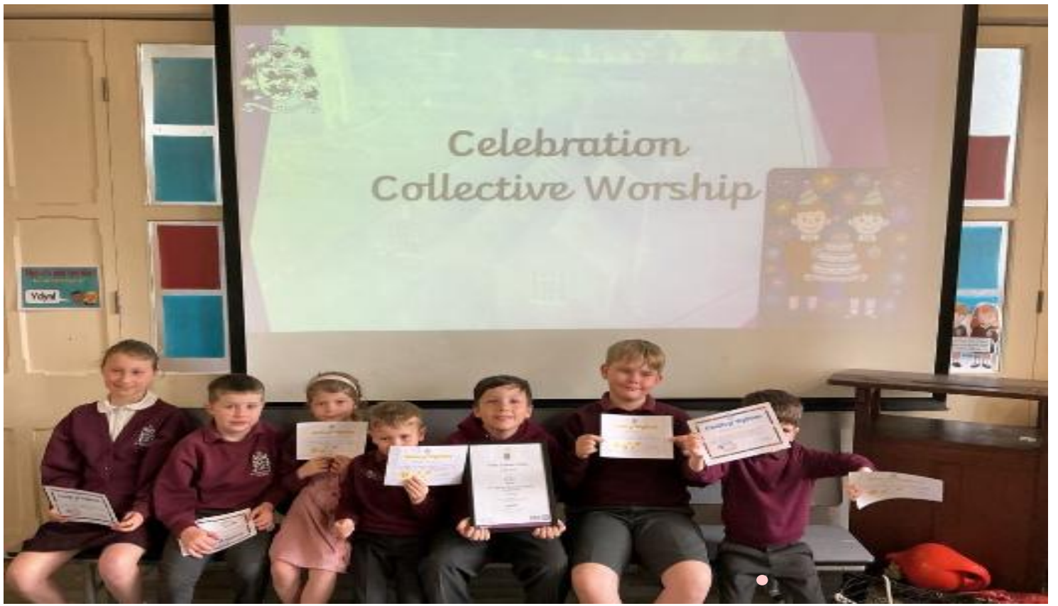
Our celebration Collective Worship