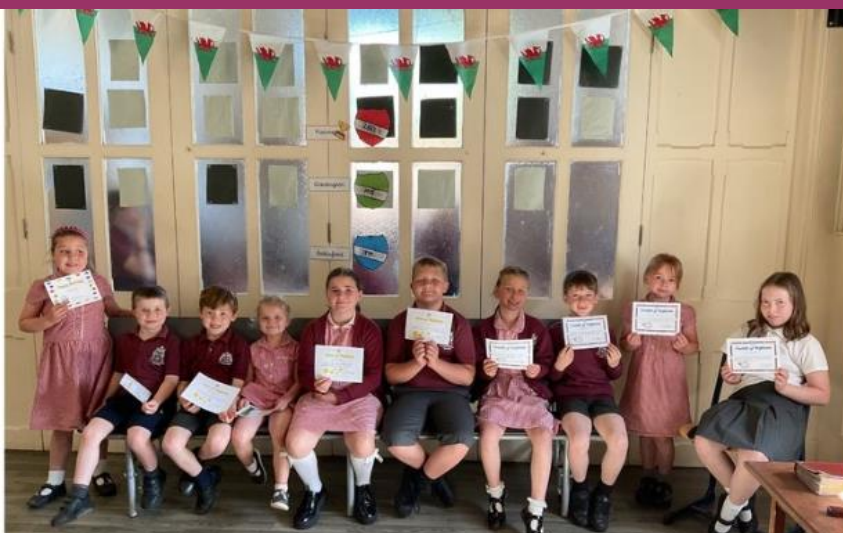
Our Stars of the week!

Our Eco council are organising a swap shop for after half term.