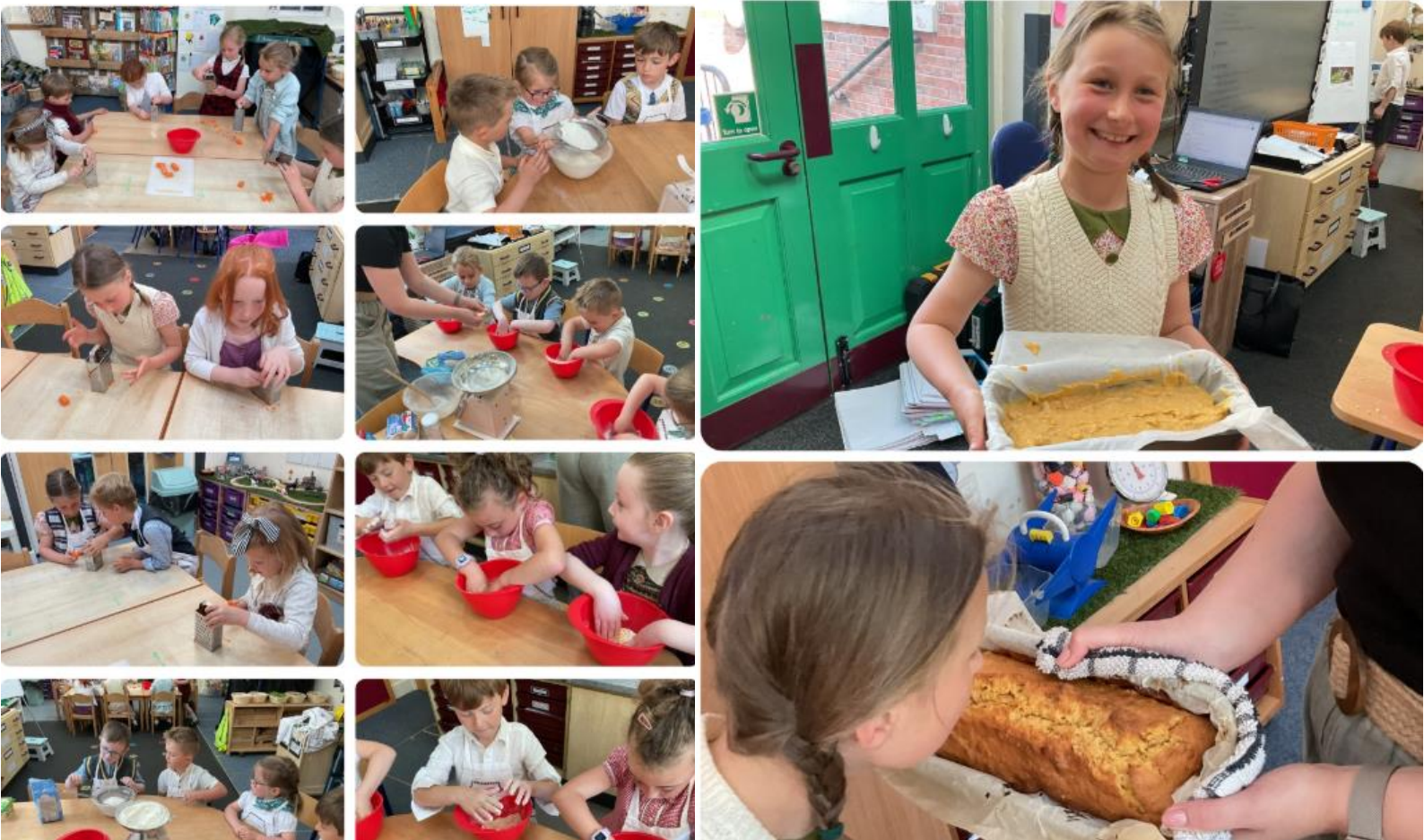
Dosbarth 2 enjoyed their immersion day of being a World War II evacuee. They baked ration carrot cake and completed activities in the learning areas based on WWII.