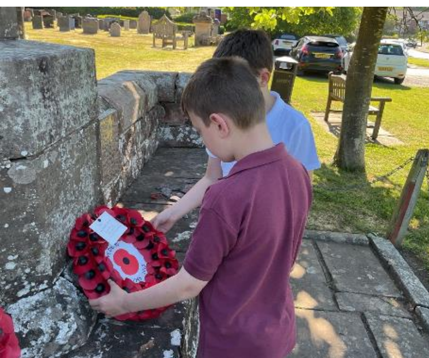
As part of our VE Day celebrations we lay a VE Day Poppy Wreath at the War Memorial.