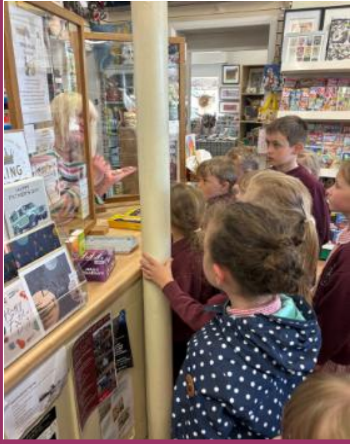
Dosbarth 2 applied their money skills into a real life situation in Hanmer shop.