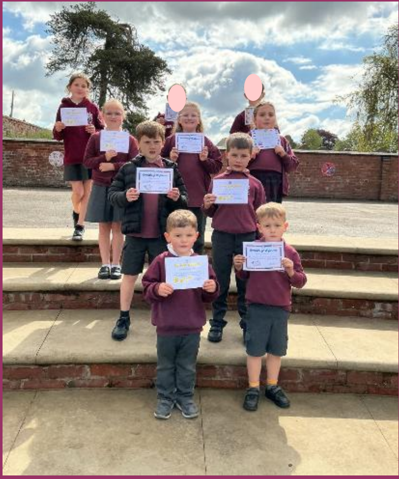
Well done to our Star's of the week!

*Due to other experiences the days may change