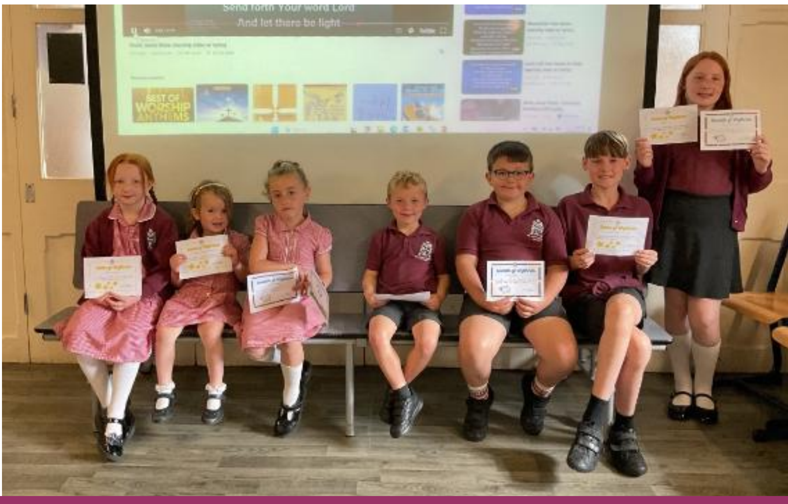
Our Celebration Collective Worship

Our email system has changed to BromCom Please check you spam/junk files for St Chad's Church in Wales School- <a href="mailto:15301@bromcomcloud.com">15301@bromcomcloud.com</a> and add it to your contacts To respond to an email please use our mailbox email above.