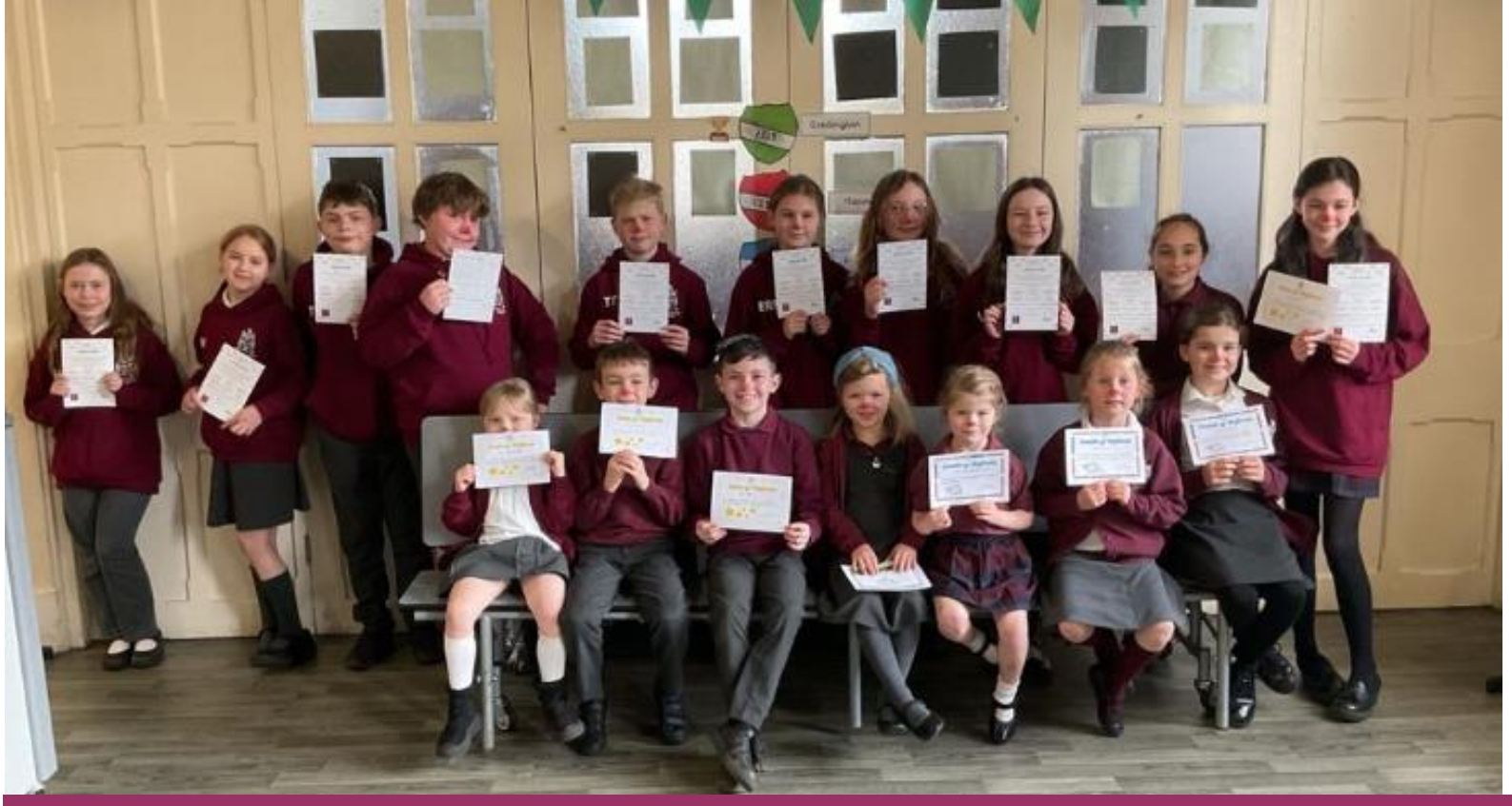
Our stars of the week!