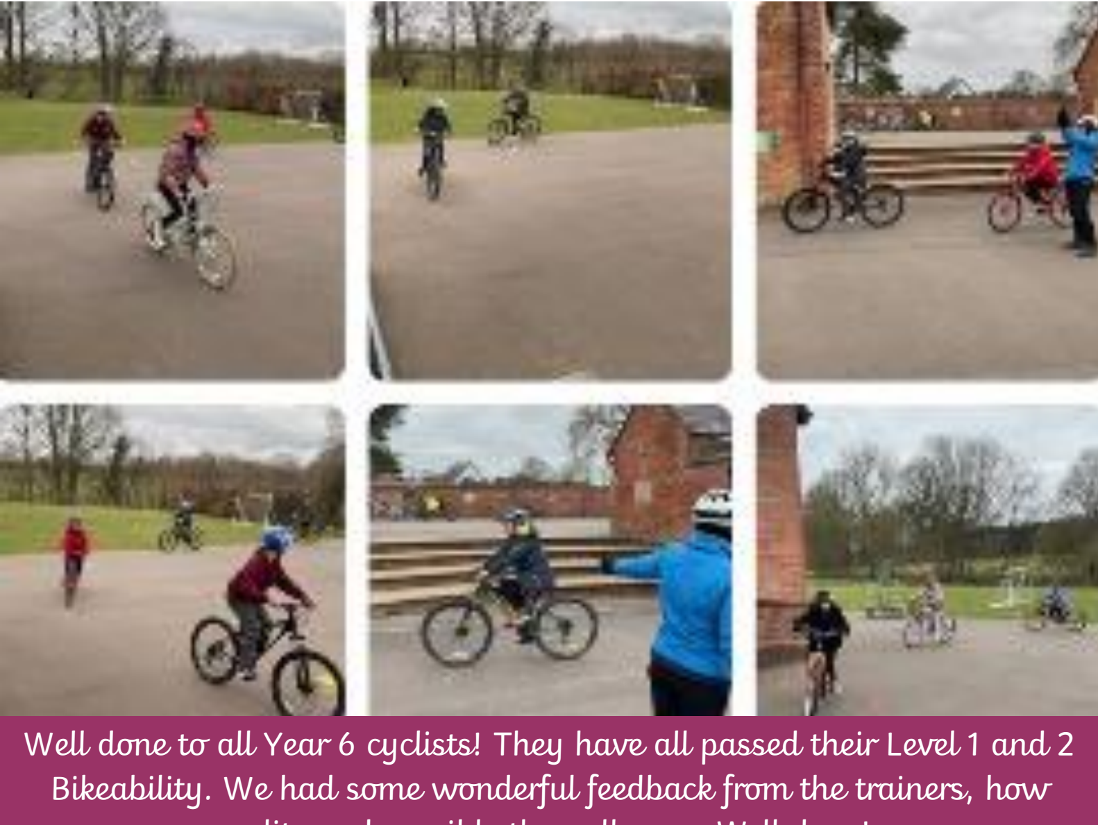
polite and sensible they all were. Well done!