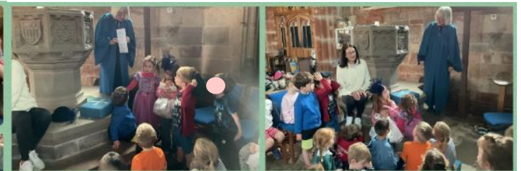
A mock baptism