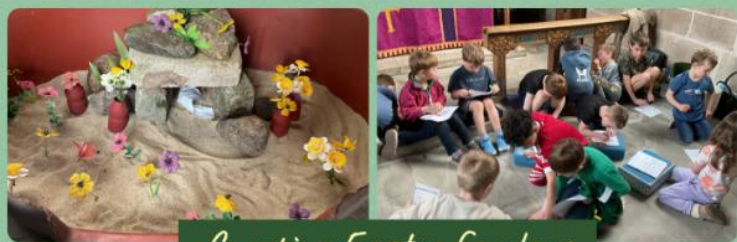
Creating Easter Gardens