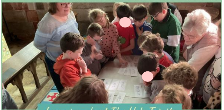
Learning about The Holy Trinity