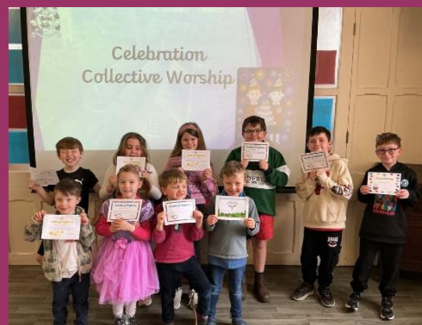
Our celebration Collective Worship