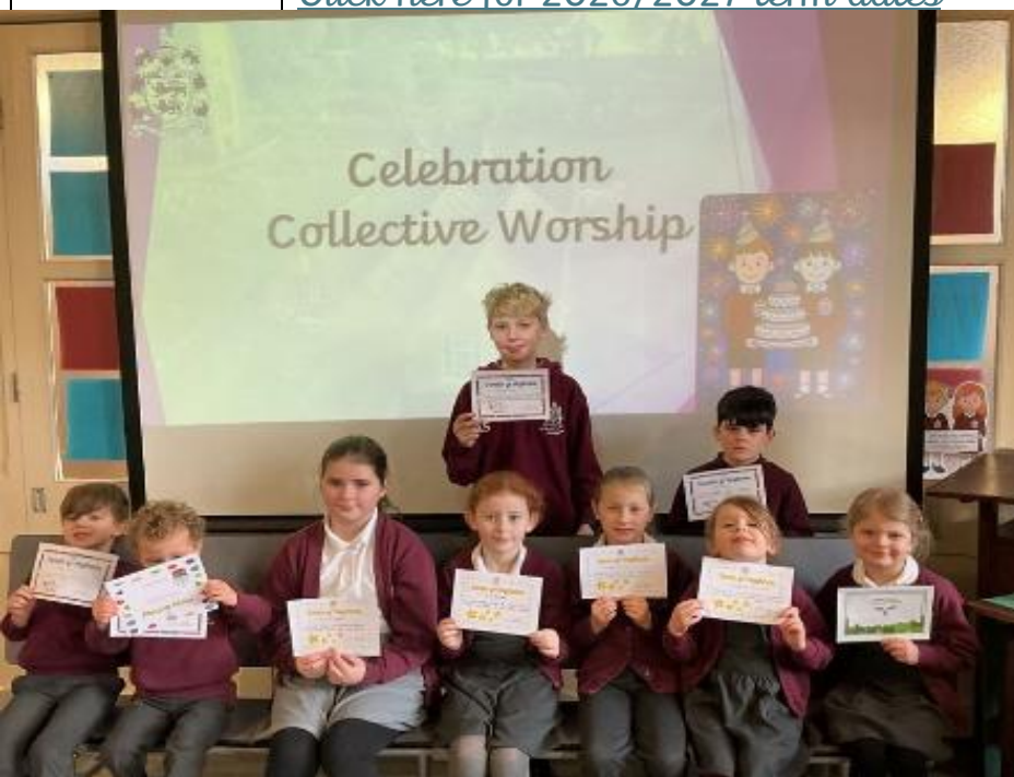
Our Celebration Collective Worship