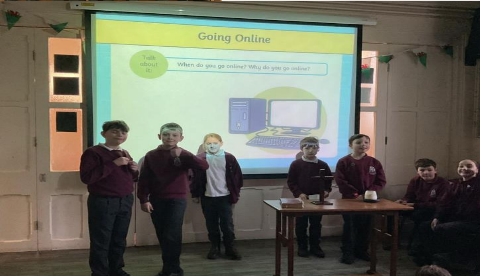
Our Digi Leaders hosted Internet Safer day this week based on the theme of scamming.