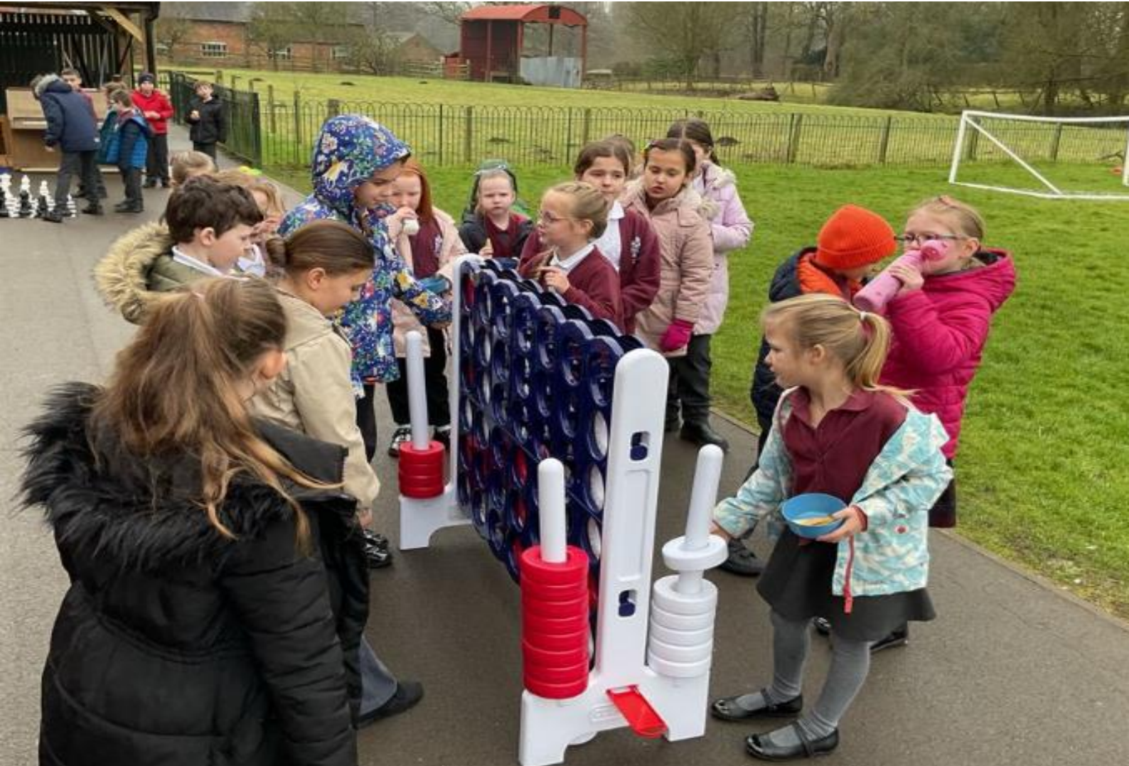
School Council have purchased some new playground equipment that the children are thoroughly enjoying! Lots of turn taking and team work!