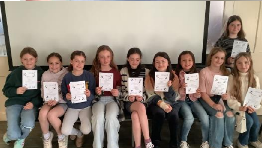
Our stars of the week!