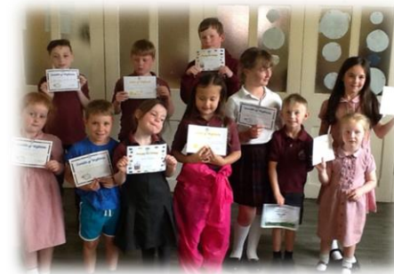
Our Celebration collective worship