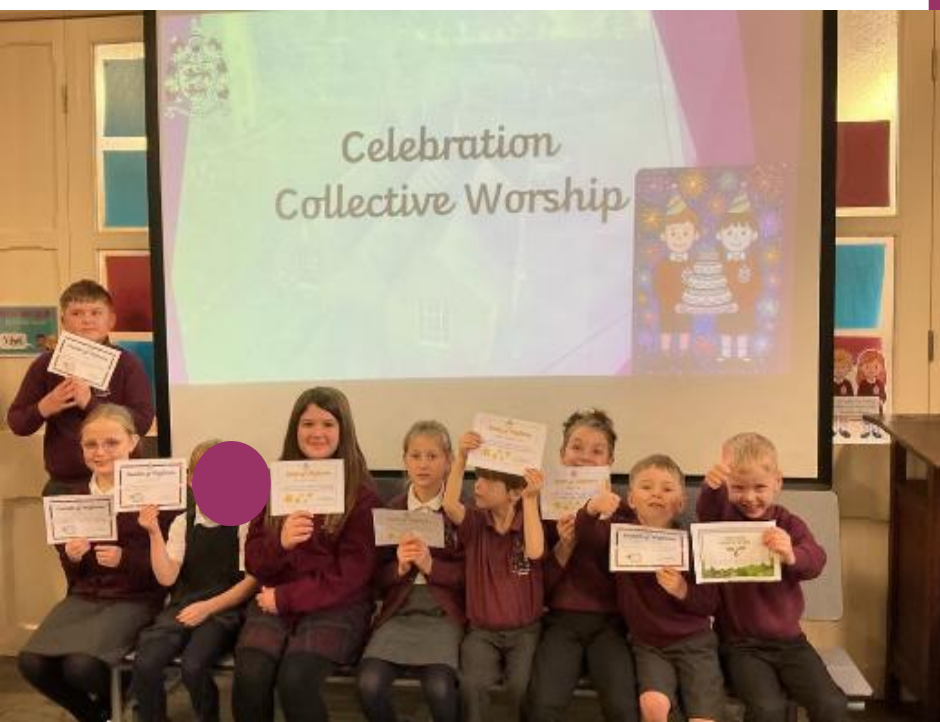
Our Celebration Collective Worship