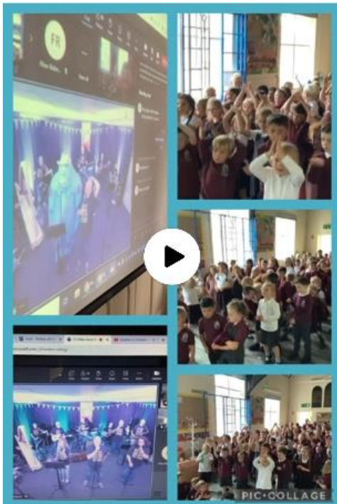
The children enjoyed the 'Make Some Noise' workshop this week.

We are creating an online booking system that will be going live on Monday. (18 th )