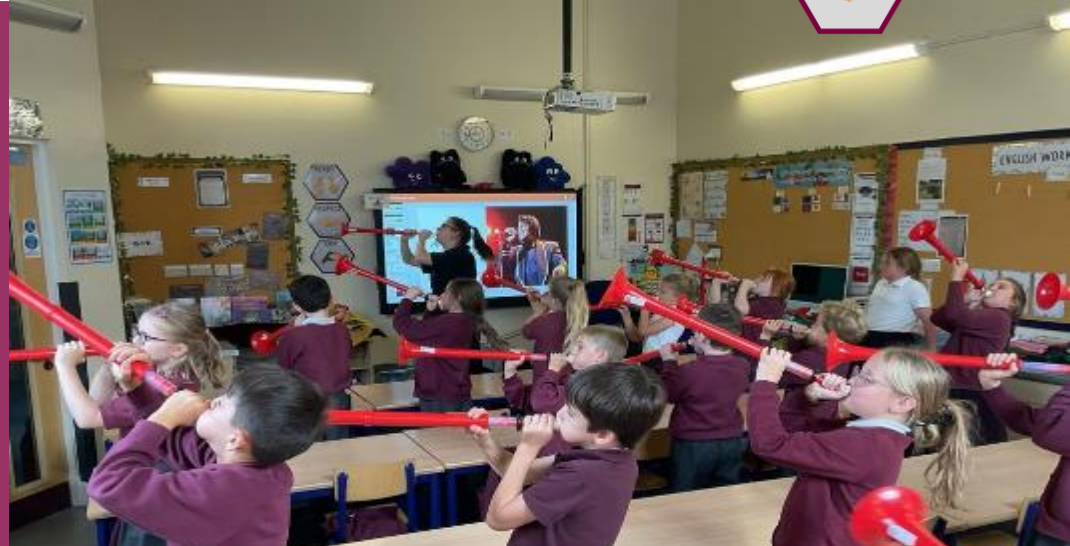
Dosbarth 3 enjoyed their music session with the Music Co-Op today. Playing the Vuvuzela.