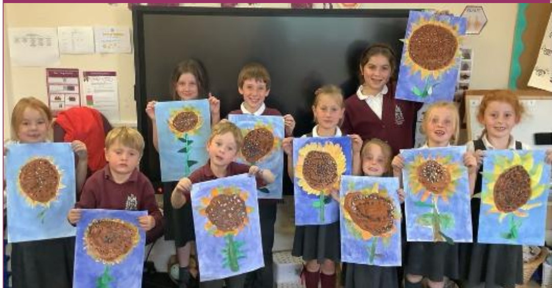
Beautiful artwork produced by our After-School Art club

We are looking forward to our Head Boy and Head Girl speeches on Friday!