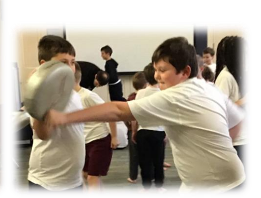
Taekwondo was a great hit!