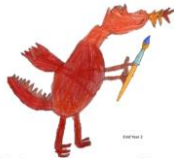
Enterprising creative contributors