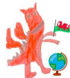
Ethical, informed citizens