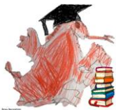
Ambitious, capable learners