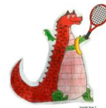
Healthy, confident individuals

The school curriculum is the culmination of all pupils’ learning experiences. It is all the planned activities that we organise in order to promote learning, personal growth and development. It includes not only the formal requirements of the Curriculum for Wales, but also the range of extra-curricular activities that the school organises in order to enrich the experience of the children.